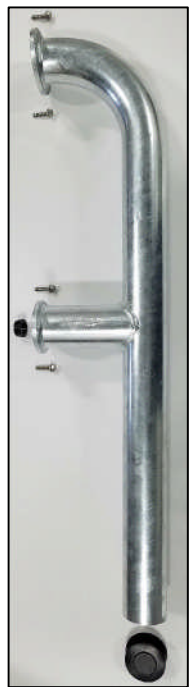
22PMAG NOT TO SCALE.

* Powder Coat colors available over galvanizing