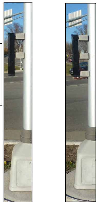
225SAPN use. 325SAPN use.